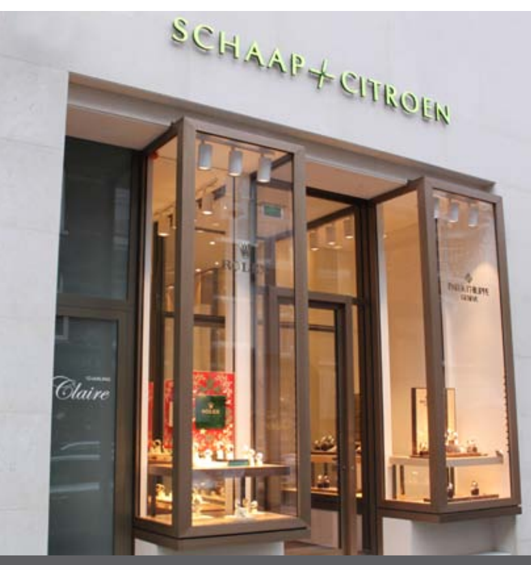
For more information contact your VeroMetal® North America retailer

Delight discerning clients with innovative ideas and save money. VeroMetal® can be substituted for for more expensive metal materials such as sheet metal or foundry. Transform environmentally sustainable MDF, recycled aluminum or drywall by applying the infinitely flexible VeroMetal® to produce gorgeous metal surfaces. With VeroMetal®, it is now possible to specify metal on surfaces (where previously) metal finishes were not possible.