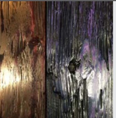
Cover bottom right: Caren Pardovitch Interior Design

email: info@bespoke-finish.com | web: www.bespoke-finish.com